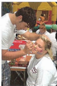
Even "big kids" enjoy having their faces painted at the Fais-Do-Do .